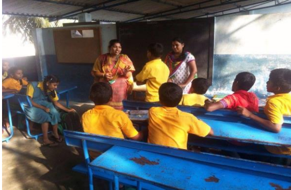
Students doing activity