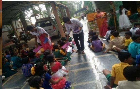
Books ready for Distributing Students distributing books and other materials