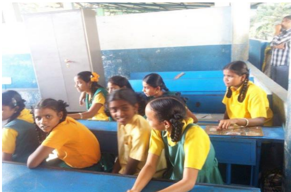
Students guiding the children