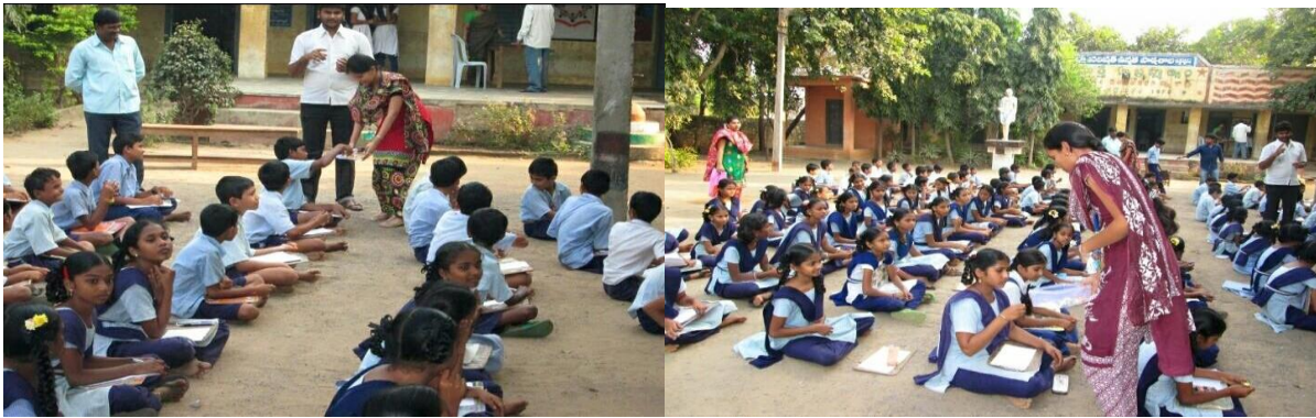
CEA volunteers distributing scales, arisers, pencils and Jamantry boxes to the students