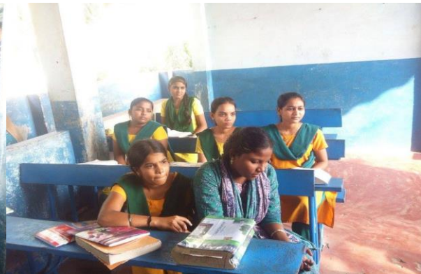
Children's lessoning the class