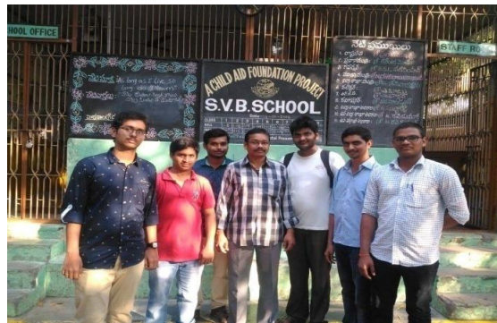
Chairman, Child Aid foundation and CEA team Event Organisers