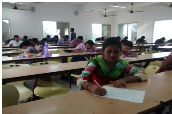
Students participating in Essay writing competitions