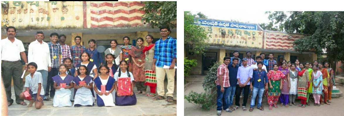
Group photo of the winners of the event master, drill master and CEA students