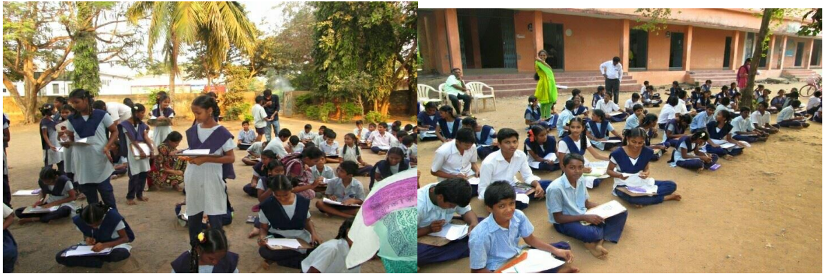
Students participating Pazzle Mania event