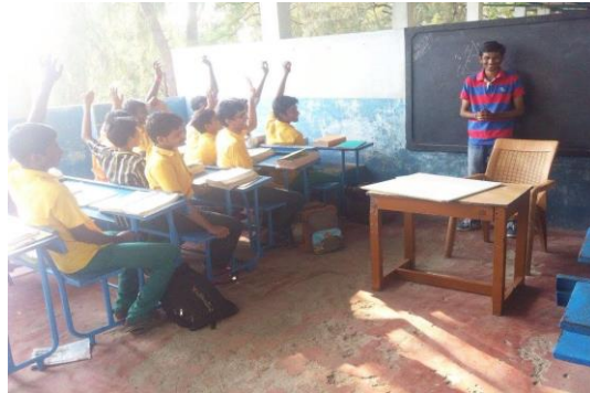
Students guiding the children