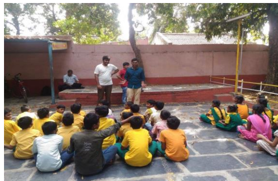
Students discussing with children